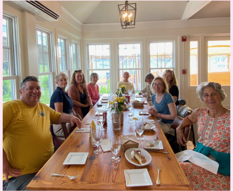
The Board of the ECOA treated the staff to a wonderful luncheon at Farm Neck as a thank you for all they do.

A Man Called Otto. 2022. Thursday, July 13, 1pm. 2hr 6 min. When a lively young family moves in next door, grumpy widower Otto Anderson meets his match in a quick-witted, pregnant woman named Marisol, leading to an unlikely friendship that turns his world upside down. *This has been rescheduled from June.